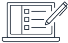
Flexible learning formats

AWS Partners will gain the skills, certifications, and real-world experience needed to accelerate customer transformation and grow their business, through: